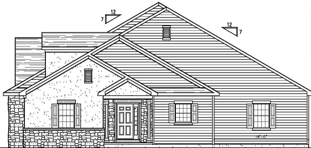
PROPOSED RIGHT SIDE ELEVATION